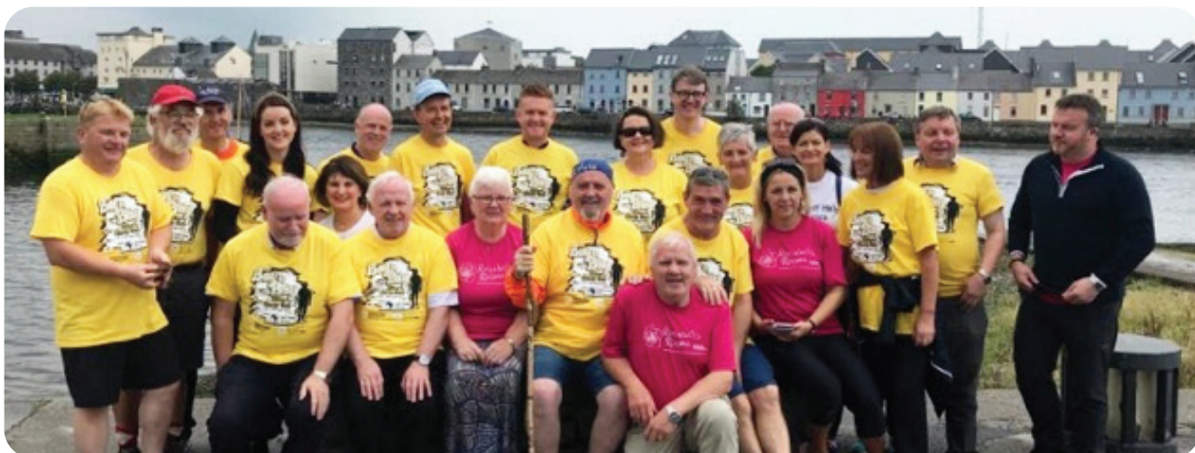
'Bay-to-Bay Walk' in aid of Galway RCC, among other charities.

The Capacitar group meets on Wednesdays from 1pm to 2pm. Capacitar connects the mind and body to combat negative thoughts and manage anxiety using guided meditation, Acupressure, Mindfulness techniques, Visualisation and breathing exercises. Tai Chi body movement is incorporated to promote serenity through gentle movement.