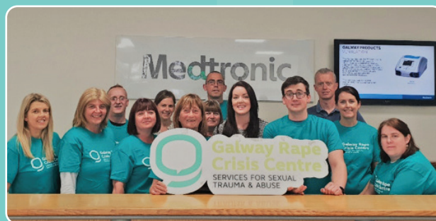
Staff from Medtronic Mervue took part in the Streets of Galway in aid of Galway RCC