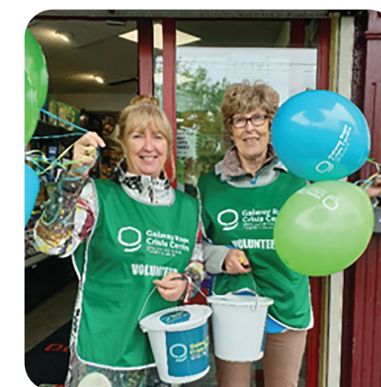
2019 Flag Day in aid of Galway RCC