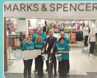
Marks & Spencer Galway, Sports and Social Club Greenway Cycle