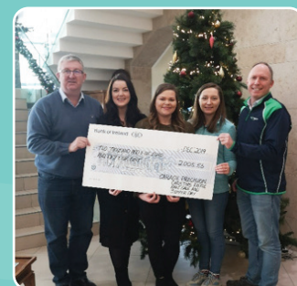
Caragh Precision's Christmas Raffle, Bake Sale and Jumper Day