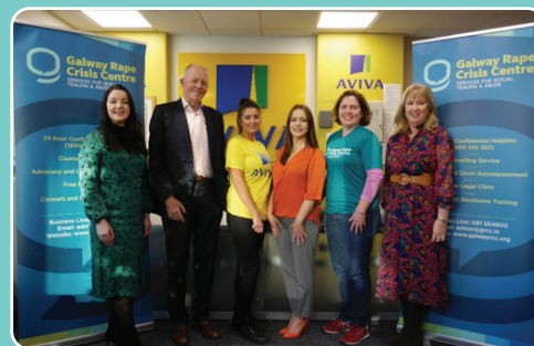
Launch of the Aviva Galway/Galway RCC Partnership