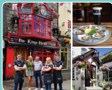
The Grealysh Family celebrated 30 years in business and kindly included Galway RCC in their special celebrations