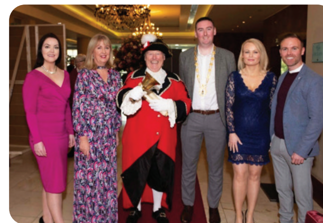
The 2019 Ladies' Lunch